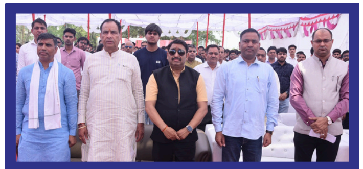
HON'BLE EDUCATION MINISTER SHRI MAHIPAL DHANDA GOVERNMENT OF HARYANA