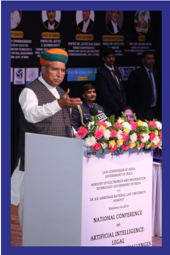
SHRI ARJUN RAM MEGHWAL MINISTER OF LAW AND JUSTICE, GOVERNMENT OF INDIA