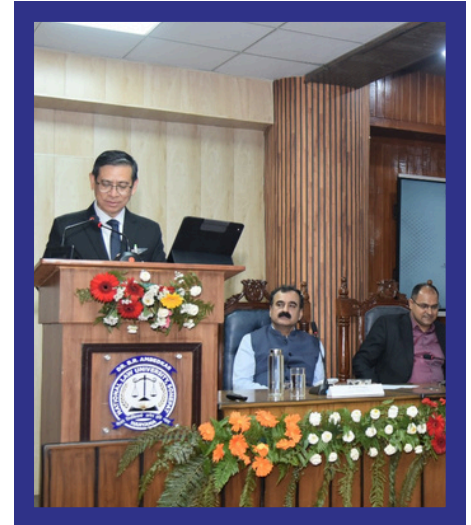
HON'BLE MR. JUSTICE N. KOTISWAR SINGH, JUDGE OF THE SUPREME COURT OF INDIA