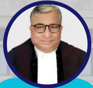
Hon'ble Mr. Justice Krishna Murari

Former Judge, Supreme Court of India & Honorary Distinguished Professor, DBRANLU