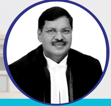
HON'BLE MR. JUSTICE BHUSHAN RAMKRISHNA GAVAI

HON'BLE GOVERNOR OF HARYANA & CHANCELLOR OF DR. B.R. AMBEDKAR NATIONAL LAW UNIVERSITY, SONEPAT