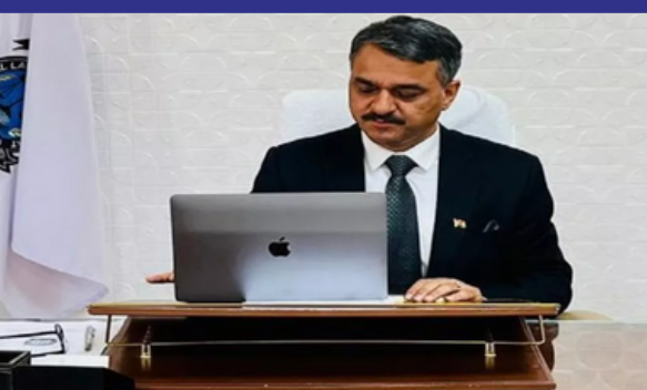
HON'BLE VICE- CHANCELLOR, DR. B.R. AMBEDKAR NATIONAL LAW UNIVERSITY, SONEPAT