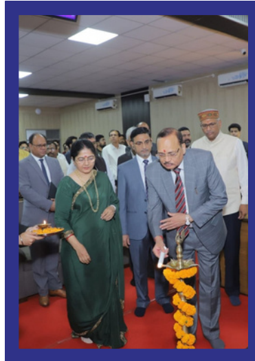
HON'BLE MR. JUSTICE SURYA KANT, JUDGE OF THE SUPREME COURT OF INDIA